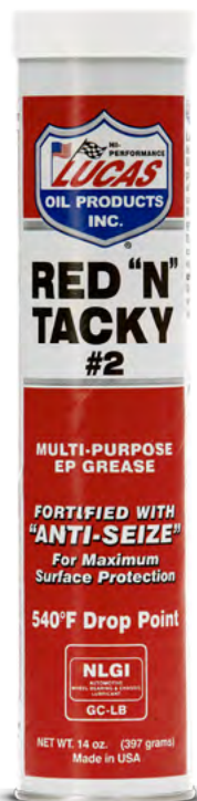
Part Number: 10005LUC